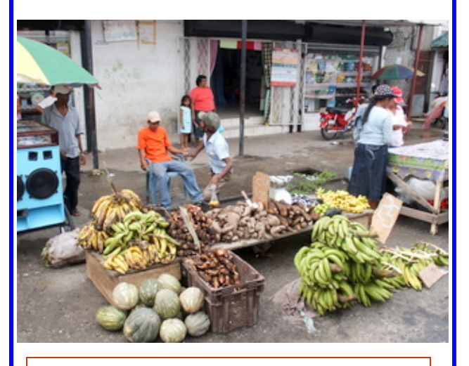
Local street market