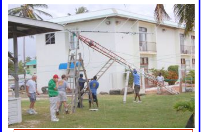
Antenna on Tower, propped up by a ladder