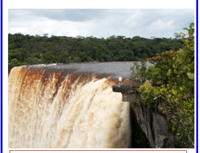
W3CMP at Kaieteur Falls (white dot on the rock ledge to the right of the falls)