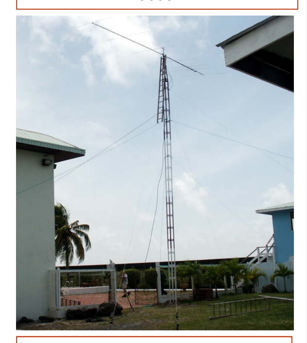
Antenna set to go, ladder still attached